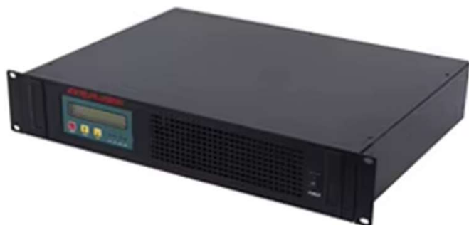
** Shown with optional display